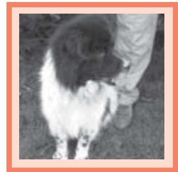
PANDA, ABOVE, AND SASHA TO THE RIGHT, ARE LOOKING FOR THEIR FOREVER HOMES THROUGH HCHS'S SENIOR PALS PROGRAM.