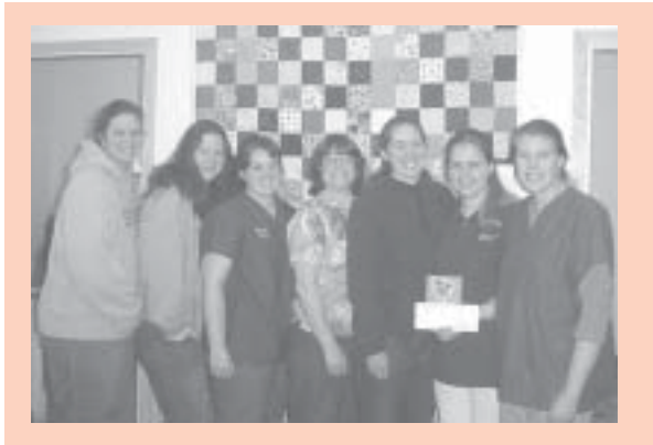
SUNY DELHI VETERINARY TECHNOLOGY STUDENTS PRESENT A CHECK FOR $800 TO THE SHELTER TOWARDS OUR DISHWASHER FUND. THE STUDENTS RAISED THIS MONEY THROUGH BOTTLE DRIVES, BAKE SALES, AND OTHER CREATIVE FUND DRIVES.